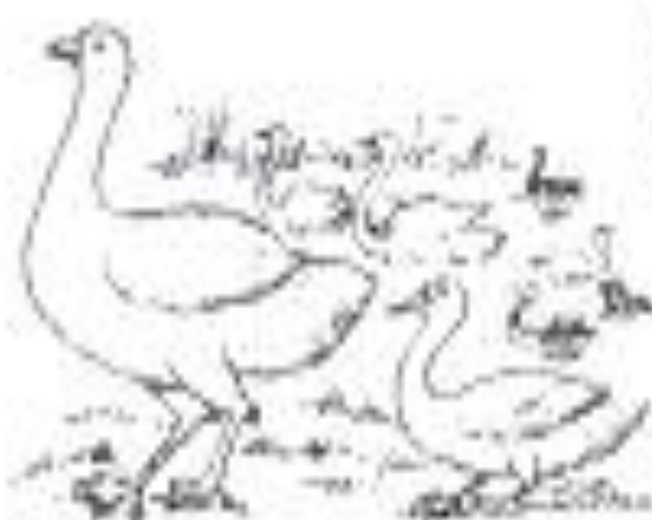
WEB-FOOTED BIRDS & THEIR EGGS