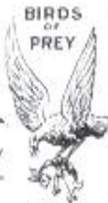
BIRDS OF PREY