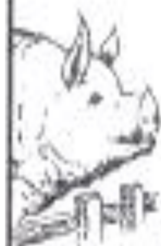
PORK BACON & HAM RABBITS, HARES & RODENTS