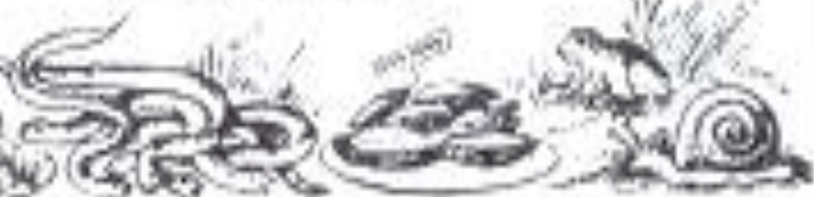
EELS: SNAILS AND ALL CREEPING THINGS THAT CRAWL, FLY OR SWIM.