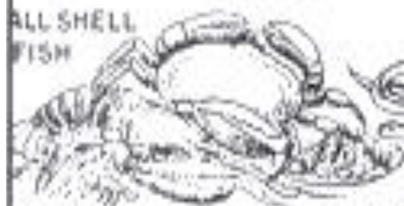
AND FISH WITHOUT BOTH SCALES & FINS